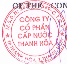
Le The Son